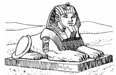
An Egyptian sphinx