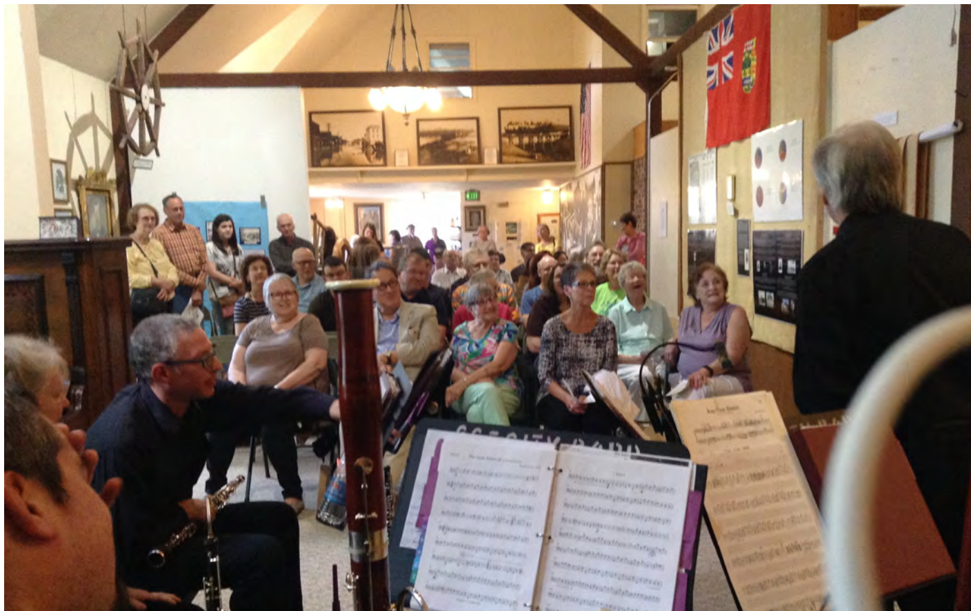
New York Kammermusiker performance with the Grand Forks County Historical Society.

The Arts Midwest Touring Fund provides financial support to arts organizations in the Midwest to present work by touring artists.