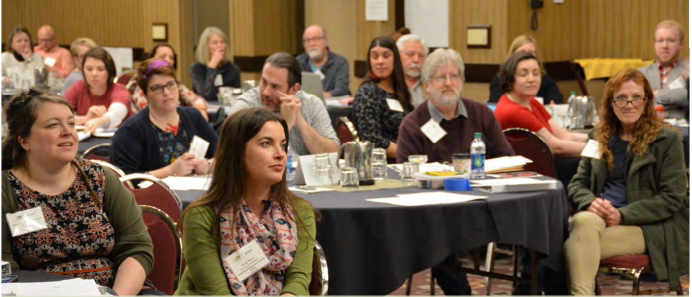
ArtsLab provides professional development and networking opportunities in order to build long-term capacity for Midwestern arts organizations.

ArtsLab strengthens the impact of arts organizations in urban and rural communities through leadership and strategy development.