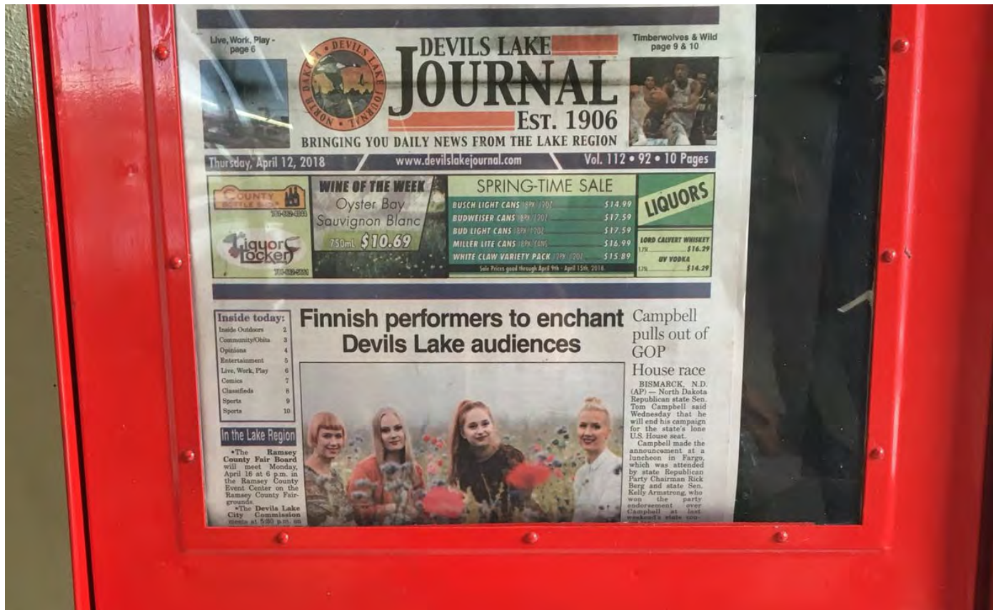
Performances by Finnish musical ensemble Kardemimmit were front page news in Devils Lake, North Dakota during last year’s Arts Midwest World Fest.