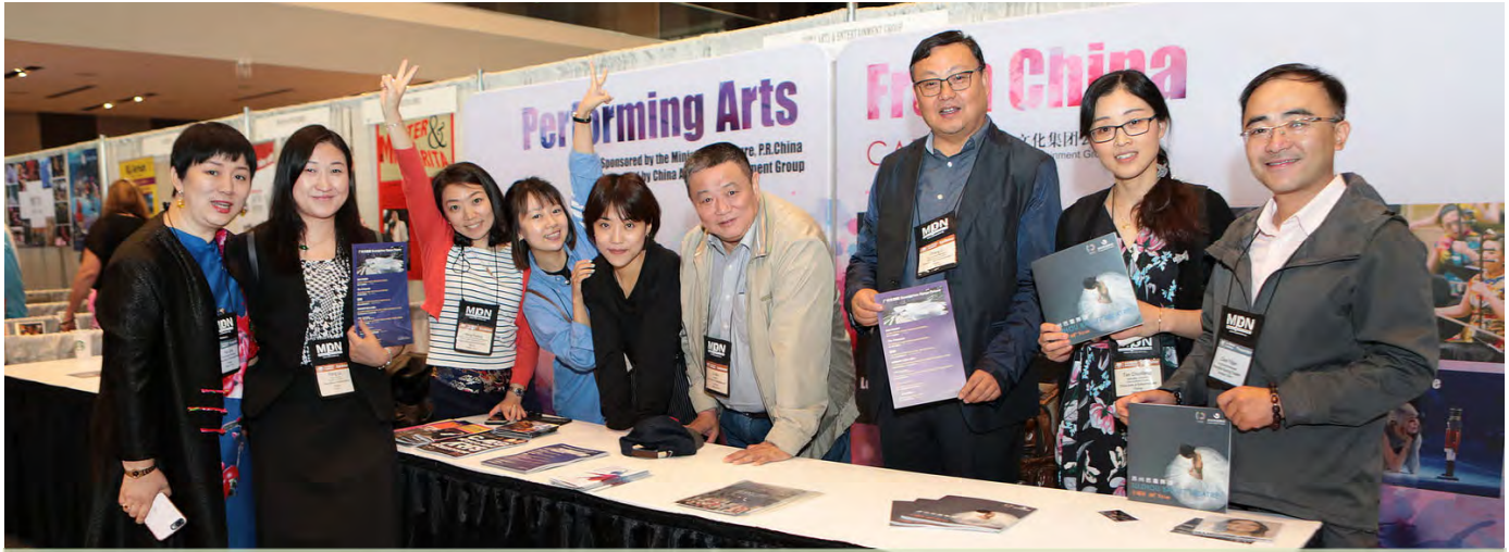
Attendees visited the 2017 Arts Midwest Conference from across the globe.