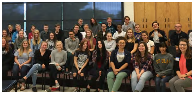
Cabaret workshop with Santino Fontana at Central High School.

Grants of up to $4,000 are awarded to performing arts organizations to bring professional performances to their community. Engagements feature a public performance and community activity and reach an audience with limited access to the arts fostering exchange between artist and community.