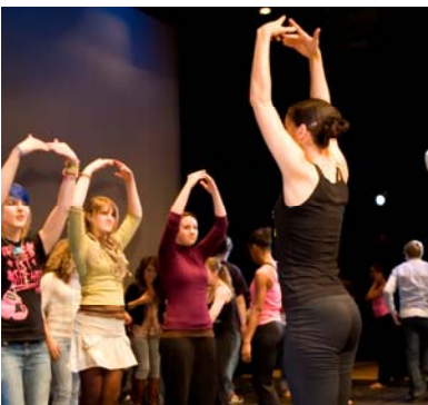
Cleo Parker Robinson Dance Ensemble residency

Arts Midwest believes in the power and value of the arts. Community-based residencies deepen the impact on and participation of audiences. To develop a residency that is meaningful to their audience, presenters should work closely with residents of their community and the artist/ensemble.