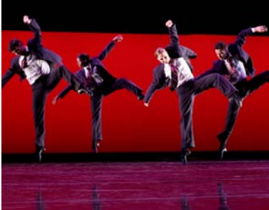
Hubbard Street Dance Chicago