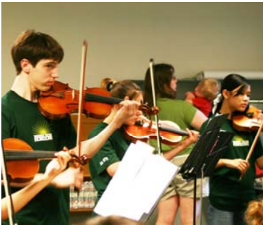
Amelia Piano Trio's residency