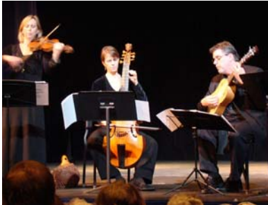
The Rose Ensemble from St. Paul, MN

Arts Midwest believes the Midwest region is home to artistic richness. As a regional arts organization serving the Midwest, we encourage presenters to engage performing artists from Arts Midwest's nine-state region. An artist's residence status is determined by the state in which the artist, not the artist's manager or agent, resides. The residence of an ensemble of artists hailing from more than one state is defined as the state in which the ensemble's business is conducted.