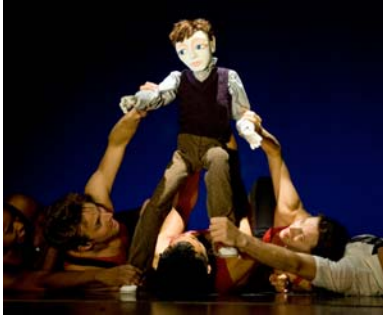
Joe Goode Performance Group's performance of Wonderboy

Arts Midwest's Performing Arts Fund supports the inter-state touring of professional performing artists specializing in the fine arts of dance, theater, music, youth and family entertainment, and other performing arts forms appropriate for communities throughout Arts Midwest's nine-state region. These engagements include public performances and in-depth educational activities reaching audiences that lack access to the performing arts.