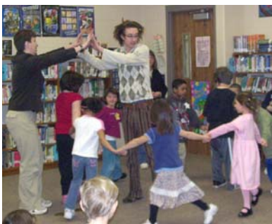
Cleveland Signstage Theatre working with deaf and hard-of-hearing children

Arts Midwest believes that all communities deserve meaningful artistic experiences. To qualify, engagements shall provide cultural access to one of these specific populations: people with disabilities, tribal communities, immigrant communities, at-risk youth, or veterans.