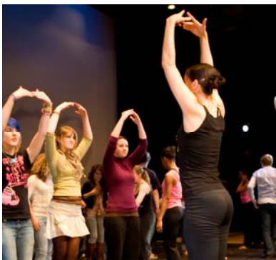
Cleo Parker Robinson Dance Ensemble residency

Arts Midwest believes in the power and value of the arts. Community-based residencies deepen the impact on and participation of audiences. To develop a residency that is meaningful to their audience, presenters should work closely with residents of their community and the artist/ensemble.