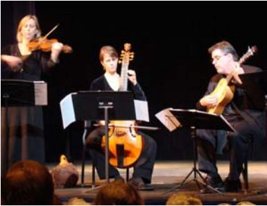
The Rose Ensemble from St. Paul, MN

Arts Midwest believes the Midwest region is home to artistic richness. As a regional arts organization serving the Midwest, we encourage presenters to engage performing artists from Arts Midwest's nine-state region. An artist's residence status is determined by the state in which the artist, not the artist's manager or agent, resides. The residence of an ensemble of artists hailing from more than one state is defined as the state in which the ensemble's business is conducted.