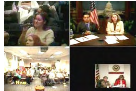
Congressman Keith Ellison fields questions during a video conference with Big Read participants in Alexandria, Egypt.

On April 28th, Congressman Keith Ellison (D-MN 5th District) was the keynote speaker in a video conference coordinated by Arts Midwest in support of Big Read Egypt/U.S. programming in Egypt. Congressman Ellison conversed eloquently with Egyptian program participants on topics ranging from the themes of civil justice and human rights found in Harper Lee’s To Kill a Mockingbird , the value of cultural diplomacy, the struggle for racial and religious equality in America and Egypt, and the benefits of international citizen-to-citizen dialogue. Congressman Ellison was introduced by U.S. Ambassador to Egypt Margaret Scobey at the U.S. Embassy in Cairo, which co-hosted the event with Big Read Egypt/U.S. community partner Bibliotheca Alexandrina in Alexandria, Egypt.