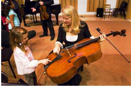
A public session at Wayne State University, Chamber Music Society of Detroit Ensemble Residency Program, supported by the Performing Arts Fund