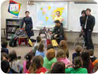
An Da Union at a school workshop in Ames, IA.