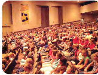
A packed auditorium for a school workshop with Mauvais Sort in Jasper, IN.

Watch a video of Mauvais Sort's workshops and public performance in Elgin, IL, at www.youtube.com/artsmidwest