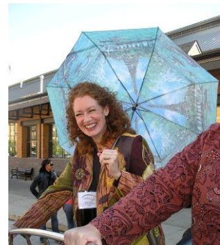
ArtsLab participants enjoy a reprieve from the cognitive labors of the first workshop.

In addition, we are pleased to announce the launch of the new ArtsLab Web site, www.artslabonline.org ! The new site will be a primary resource to ArtsLab constituents as well as the broader arts community and those interested in the field of capacity building on behalf of small and mid-sized arts organizations. We invite you to look through the site and subscribe to the ArtsLab newsletter for more specific information from the program.